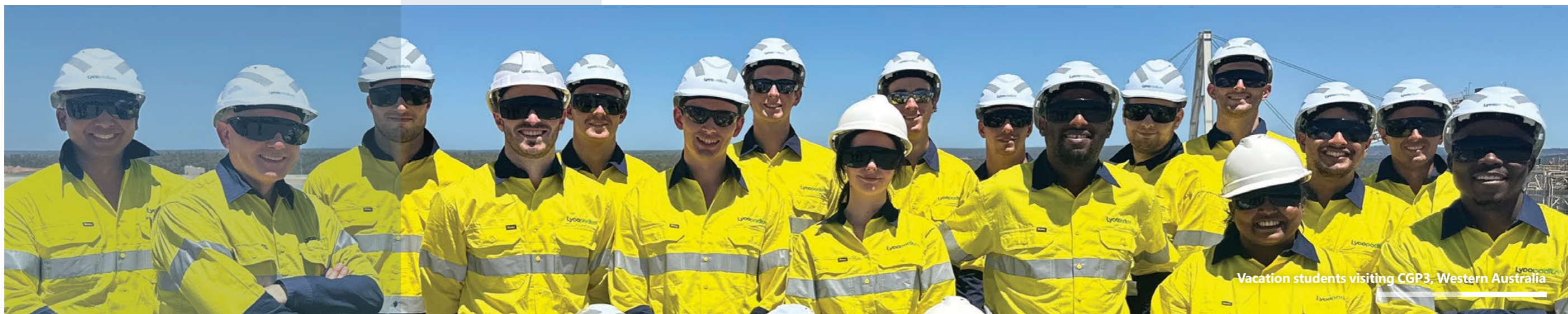
Vacation students visiting CGP3, Western Australia

For our Rail Infrastructure business, Australia's railway construction outlook is strong, supported by a number of significant publicly funded projects. This includes the development of a high-speed passenger rail network for travel between major cities and regional centres along Australia's eastern seaboard. Maintenance and rail infrastructure management (RIM) activity is continuing to grow, commensurate with the ongoing expansion of the country's heavy haul and passenger networks. Additionally, rail remediation works required as a result of extreme weather events, including floods, droughts, bushfires and coastal erosion, is expected to continue.