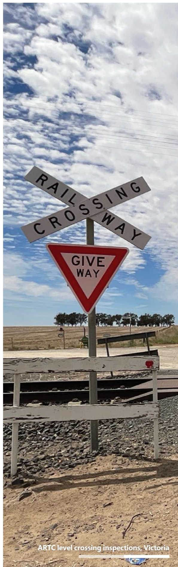
ARTC level crossing inspections, Victoria

The consolidated entity's operations are not subject to significant environmental regulation under a law of the Commonwealth or of a State or Territory in respect of its consulting activities.