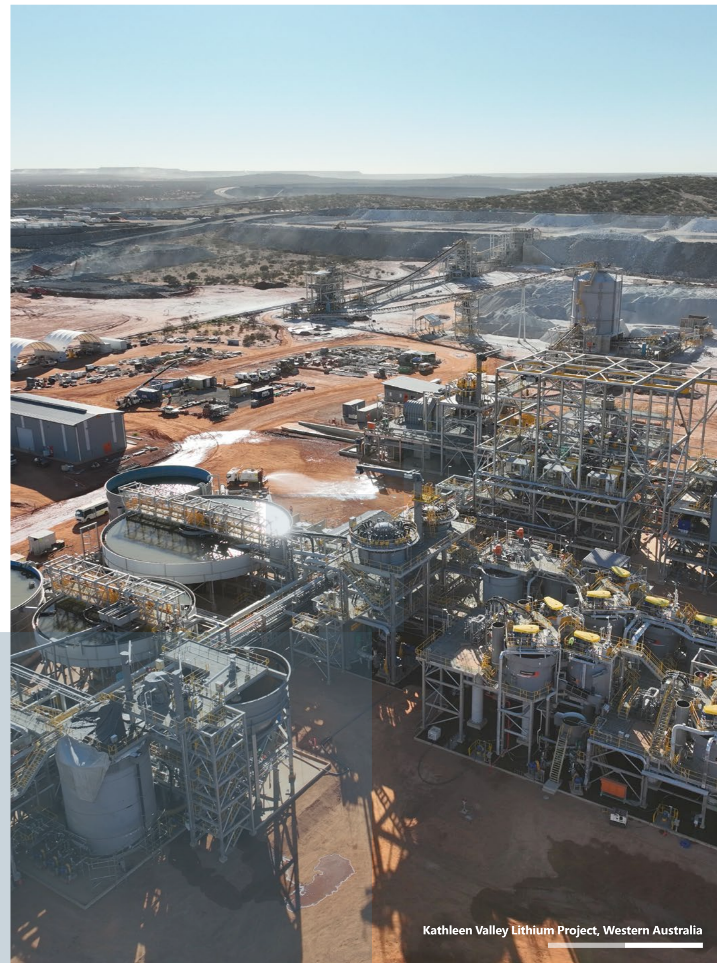
Kathleen Valley Lithium Project, Western Australia